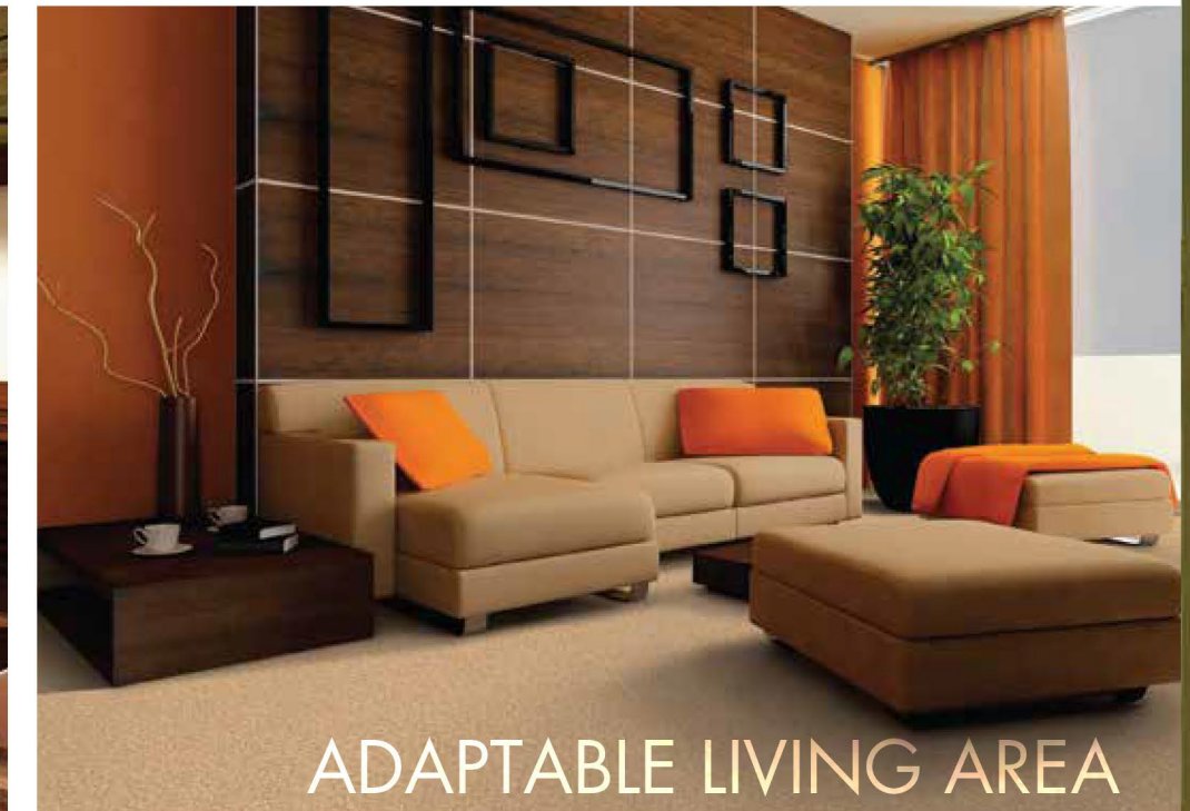
ADAPTABLE LIVING AREA