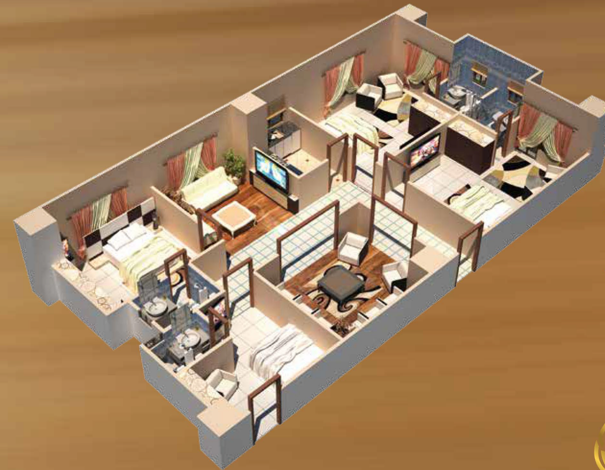
4 BED APARTMENT