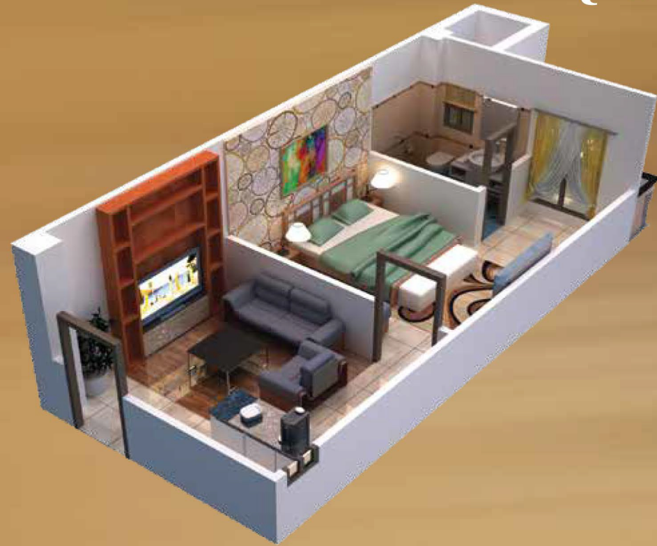
1 BED APARTMENT