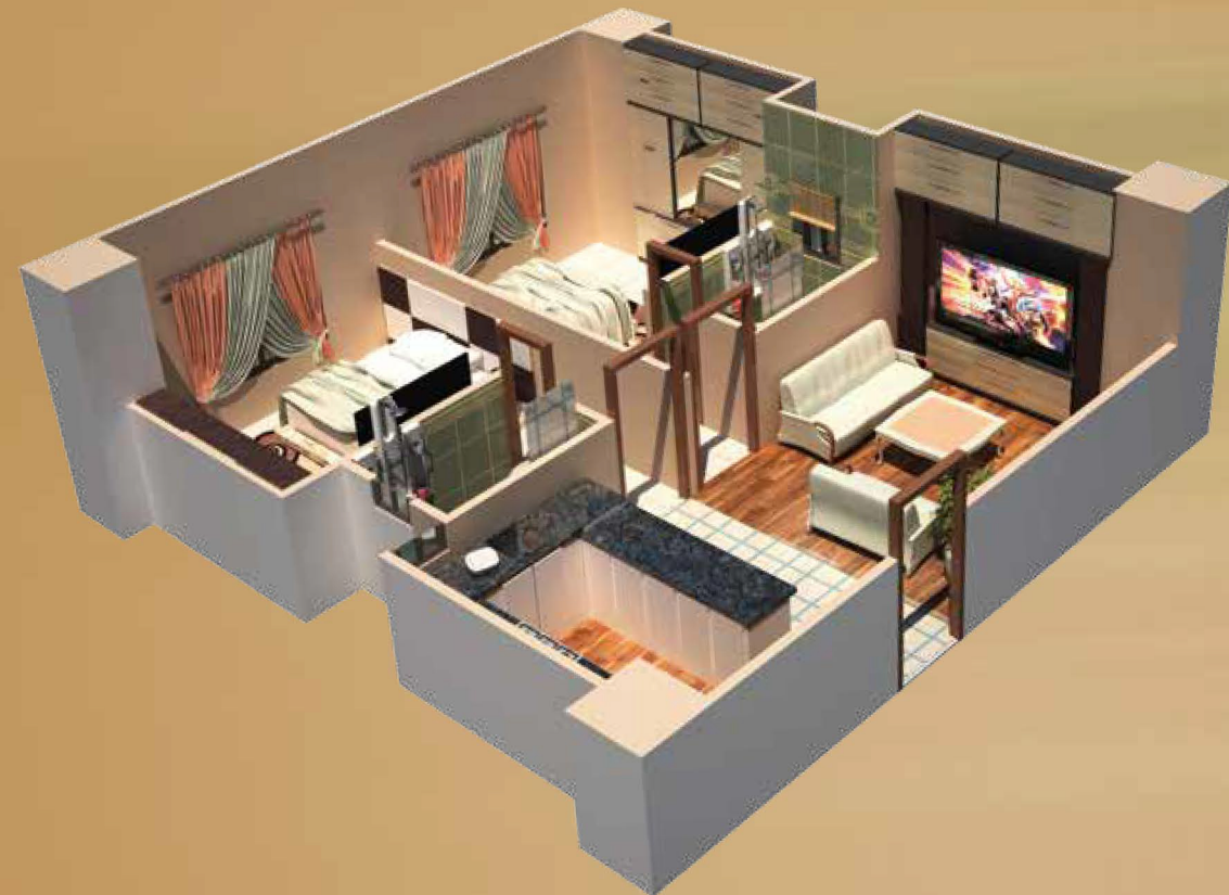
2 BED APARTMENT