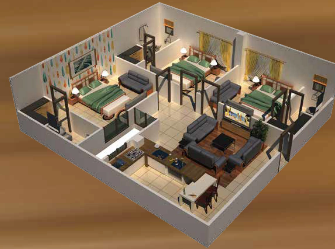
3 BED APARTMENT